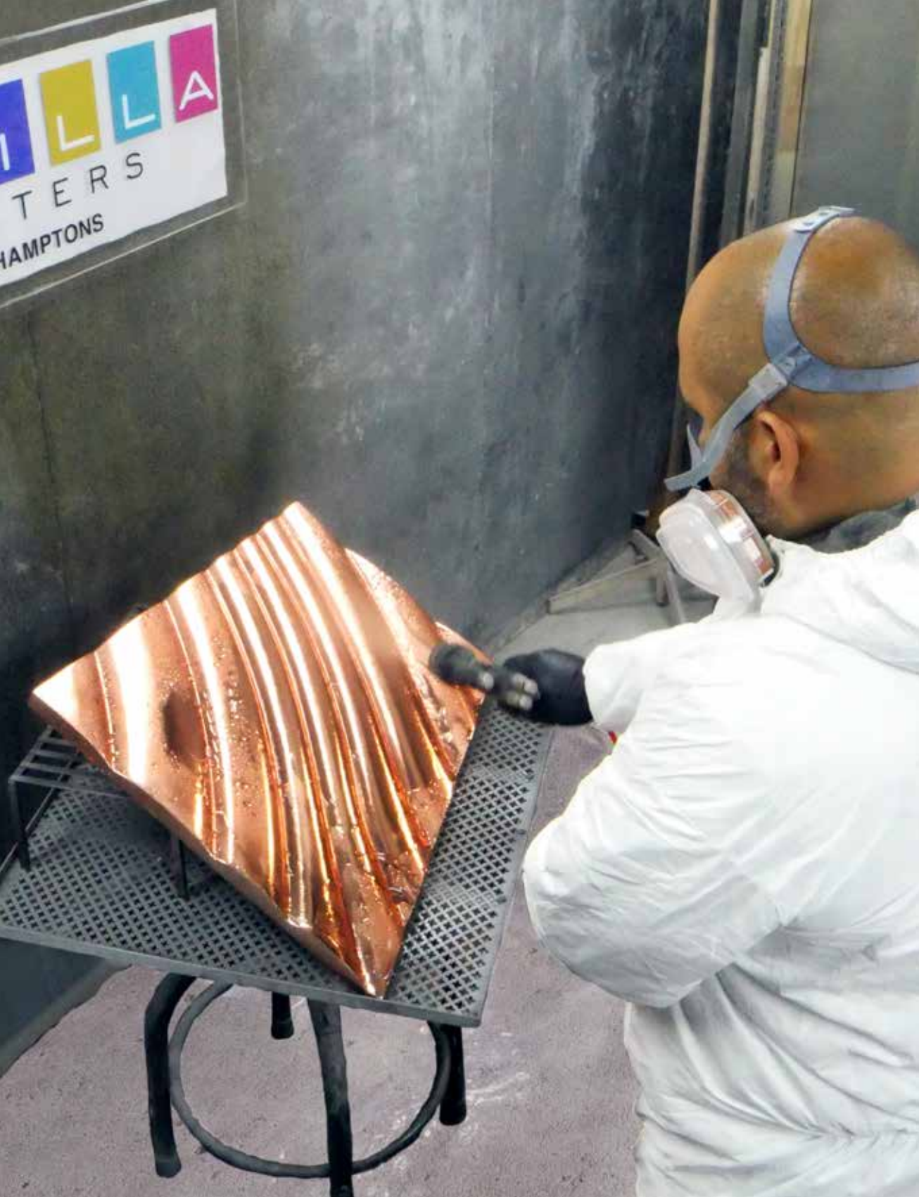
A wooden cabinet door gets a makeover from Badilla Painters, using bronze chrome from Badilla's new line, ChromableNY.

H igh-end designers and architects are constantly in search of innovative products to help them better serve their discerning clientele. As a resource for the design community, Badilla Painters considers it part of its mission to provide more tools for design professionals' proverbial toolboxes.