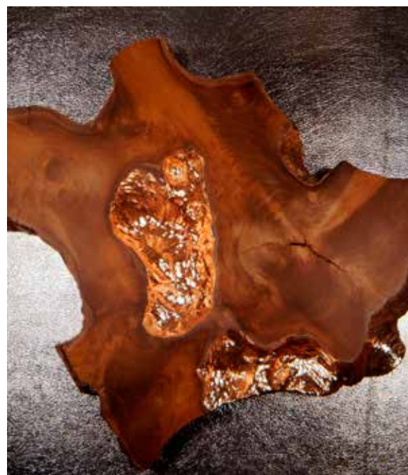
Dipped live-edge shelving shown above and at right