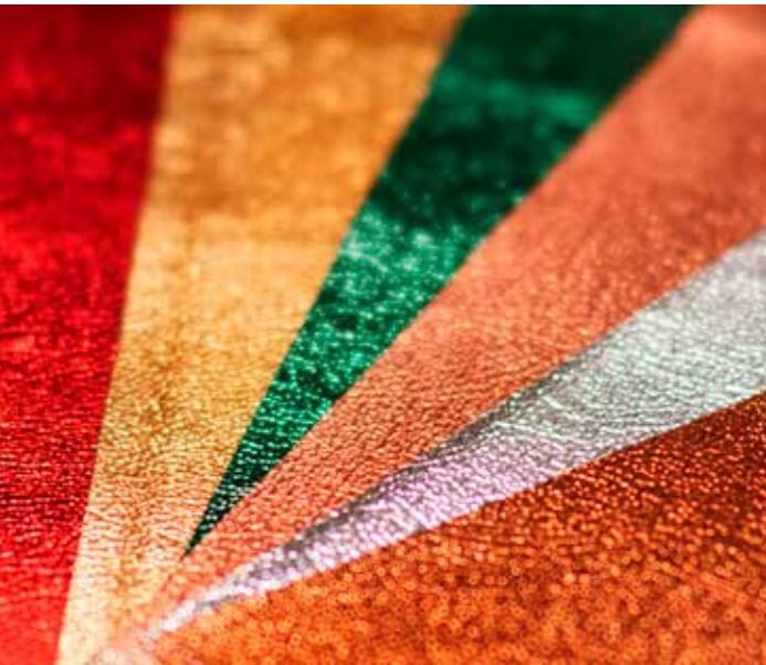
A leather rainbow displays some of Badilla's jewel collection and metal collection colors.