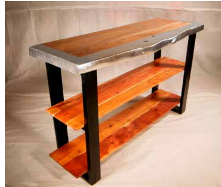
A wooden console table got some flair with platinum matte edges and high-shine chrome finishes.