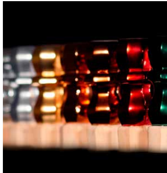
Chromed wood samples in saturated jewel tones and classic metal hues