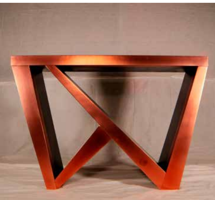
This geometric wood console table features a bright copper front.